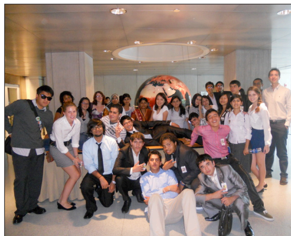
BFSIA Fellows at the World Bank.

Recent follow-on activities helped Fellows put into practice the knowledge they acquired and provided a bridge between their time overseas and their home communities. The objectives of the follow-on activities included: to examine the insights acquired by Fellows throughout the Institute take shape in the projects; to enable Fellows to see the relevance of what they learned to the reality in their respective communities; to allow Fellows to demonstrate leadership skills and become `ambassadors` of positive change; to allow Fellows to