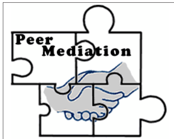
Peer Mediation Logo.

Peer Mediation (PM) when implemented within the standards developed by Association for Conflict Resolution (ACR), has the potential to improve poor school climates and reduce anti-social behaviors. These factors have been identified as barriers to academic achievement and good citizenship. Moreover, significant challenges faced by CRE programs in school systems are sustainability, poor implementation, and lack of funding. To affect change at the system level requires involvement of political leaders, school administrators, teachers, parents, unions, students, and private citizens. To deal with these challenges, we are working to build a continuing partnership with ICAR to make CRE more sustainable in the District of Columbia. ■