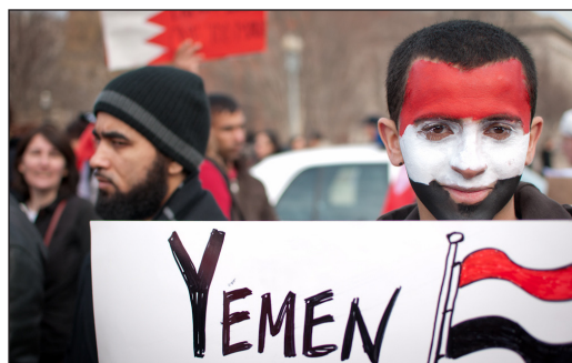
Yemeni Protestor in Washington D.C.

are staying, and so will the corruption, disorder, and qat. My condolences to the Yemeni youth: Your revolution has been infiltrated by political performers. Be wary of applauding those dancers shimmying onto the bandwagon. We have seen their moves before and it's time for a new boogie. Snakes are all over Yemen, be careful. ■